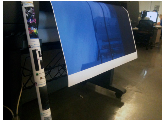
Printing large format and grid photos to prototype the exhibit.